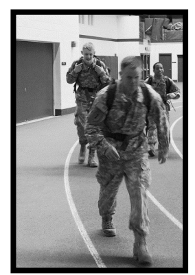
Ruck Club completes portions of their ruck march

participants are focusing on injury mitigation, stretching, and maintaining a pace. The event which takes place on the 23rd of March, marks the second time many of the cadets have completed this event and the third time for c/ Stronz. We look forward to a kicking off a great spring break with this 26.2 mile foot march!