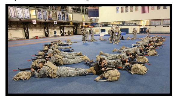
MS1s & MS2s work the triangle patrol base on the Armory floor during the familiar sub-zero temperatures experienced this winter

Other events include Ranger Buddy selection and the start up of Ruck Club. Finally, the renovation of the gym is at full speed and the Battalion is excited for a much needed improved fitness facility.